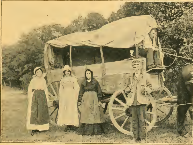
THE SETTLERS ARRIVE